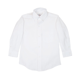
Long Sleeve Oxford