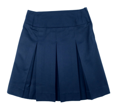
Navy Gat Skirt