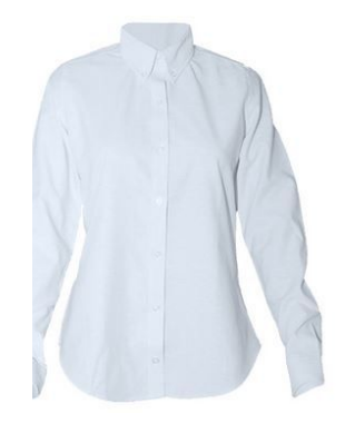
White Long-Sleeve Oxford