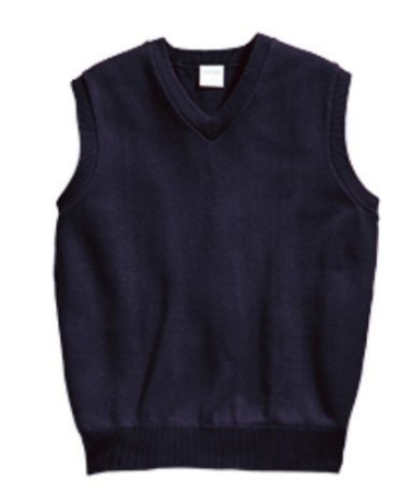
Navy V-Neck Vest