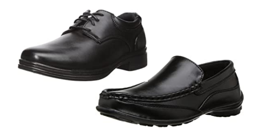
Black shoes, black soles (NO tennis shoes)