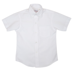
Short Sleeve Oxford