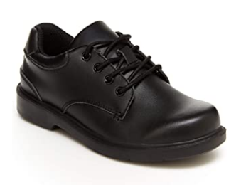
Black shoes, black soles (NO tennis shoes)