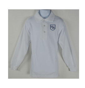
HLS Long Sleeve Polo