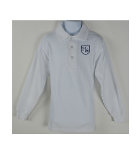
HLS Long Sleeve Polo Navy Sweater