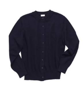
Navy Crew Neck Cardigan