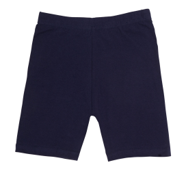
Navy Athletic Shorts (always)