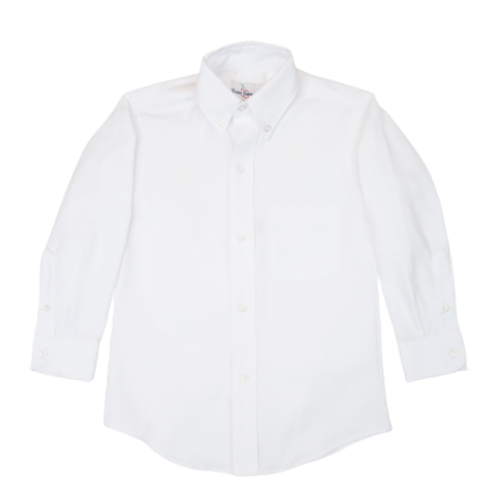
Long Sleeve Oxford