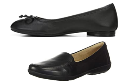
Solid black leather or suede Loafer, slip-on, or Mary Jane (Heels allowed up to 1.5")