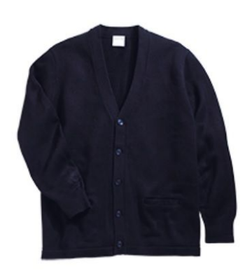
Navy V-Neck Cardigan