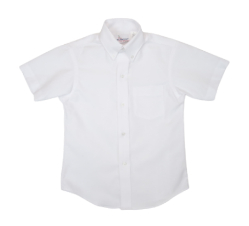
White Short-Sleeve Oxford