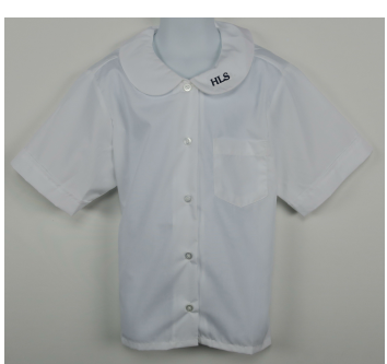
Short-Sleeve White Blouse (with HLS monogram)