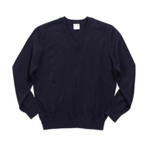
Navy V-Neck Sweater