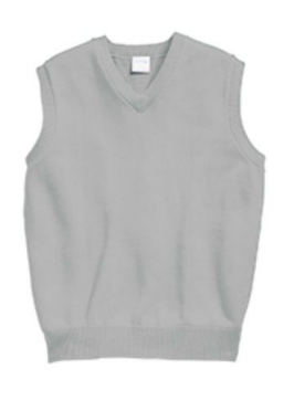
Gray Sweater Vest